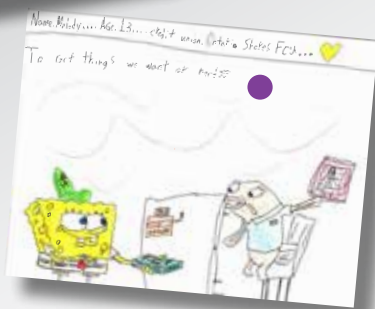
MELODY, AGE 13 ONTARIO SHORES FCU