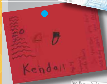
KENDALL, AGE 4 CONSUMER'S FCU