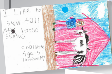
CHARLOTTE, AGE 6 ONTARIO SHORES FCU